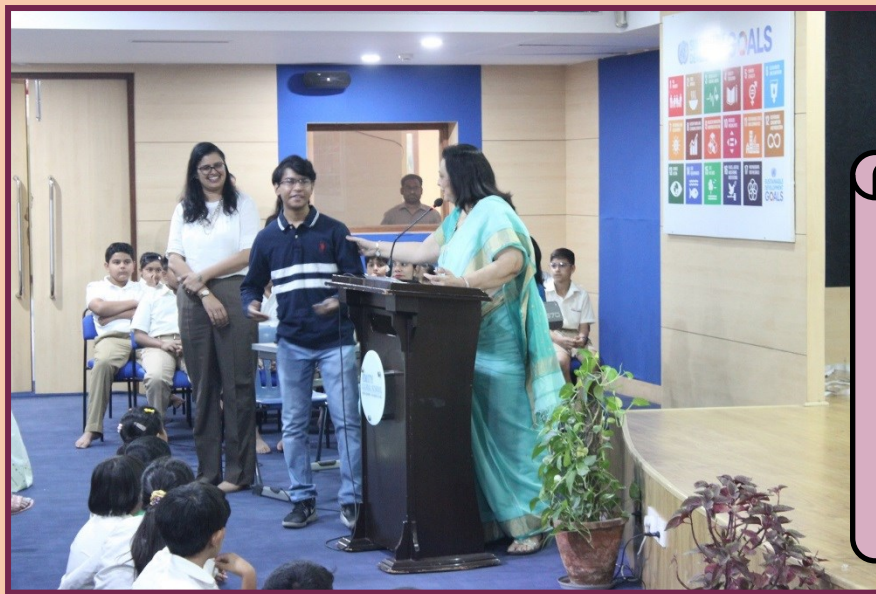
Felicitation of mentors—parents and Teachers and guests