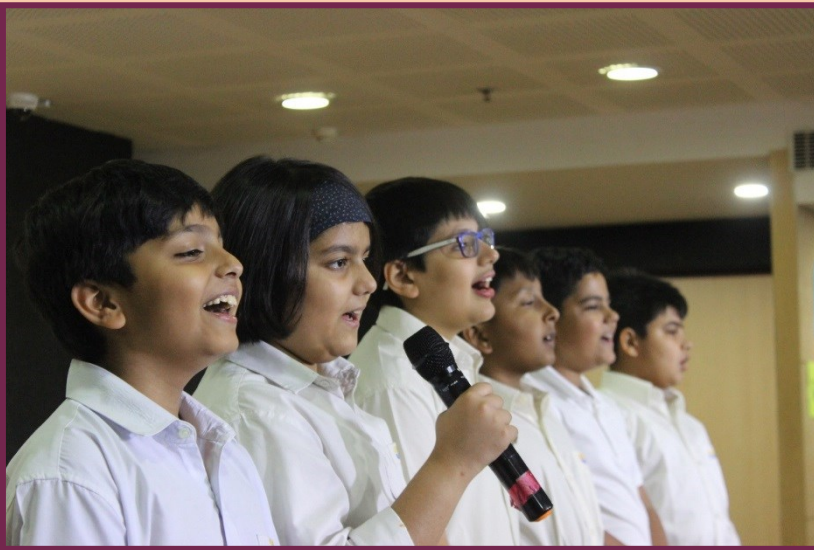
Lighting of lamp followed by Shlokas by students of grade-5