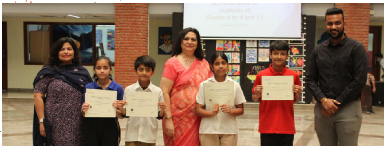
Inter-House Singing: Harmoniously, the different houses competed in the inter-house singing competition with Nile getting first place, Ganges getting second and Amazon getting third.