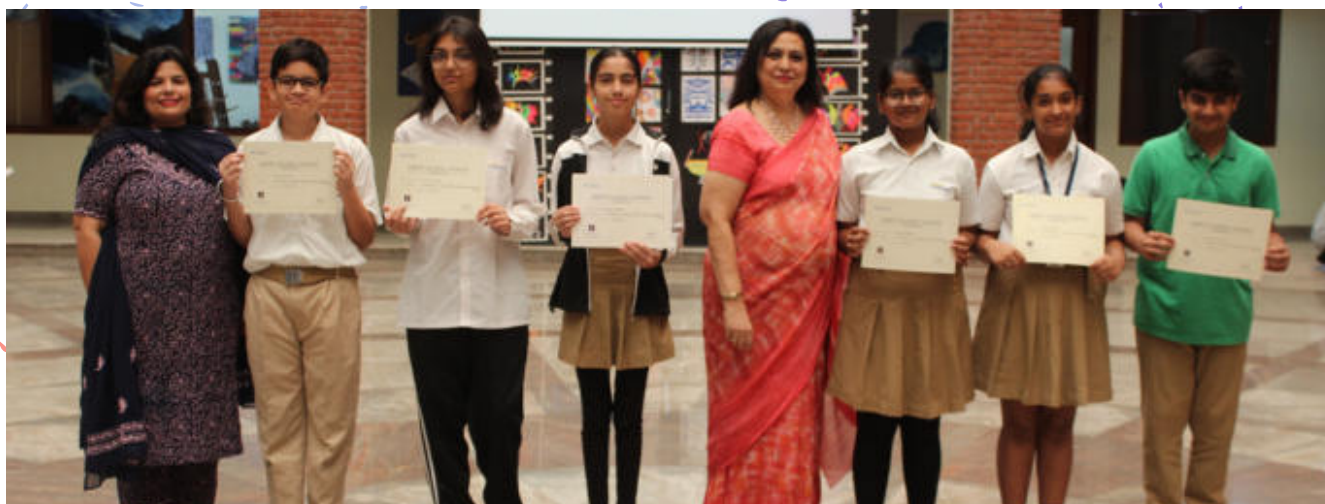
Students also took part in an inter-house poster making competition, with Zhaung taking first place, Amazon coming in second and Nile taking third.