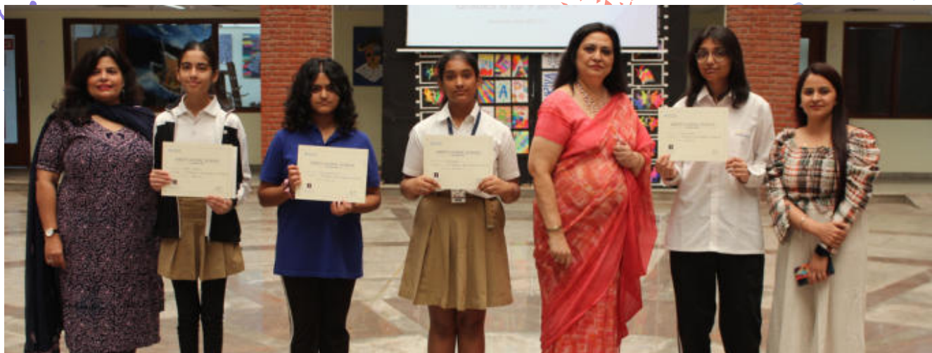
Students competed in an inter-house art competition where Nile house secured first place and Zhuang and Amazon followed.