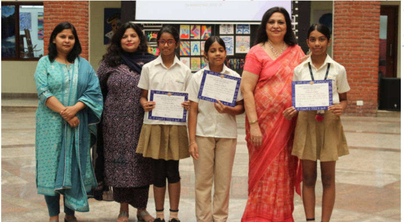
Middle school students participated in a mental math competition and received participation awards.