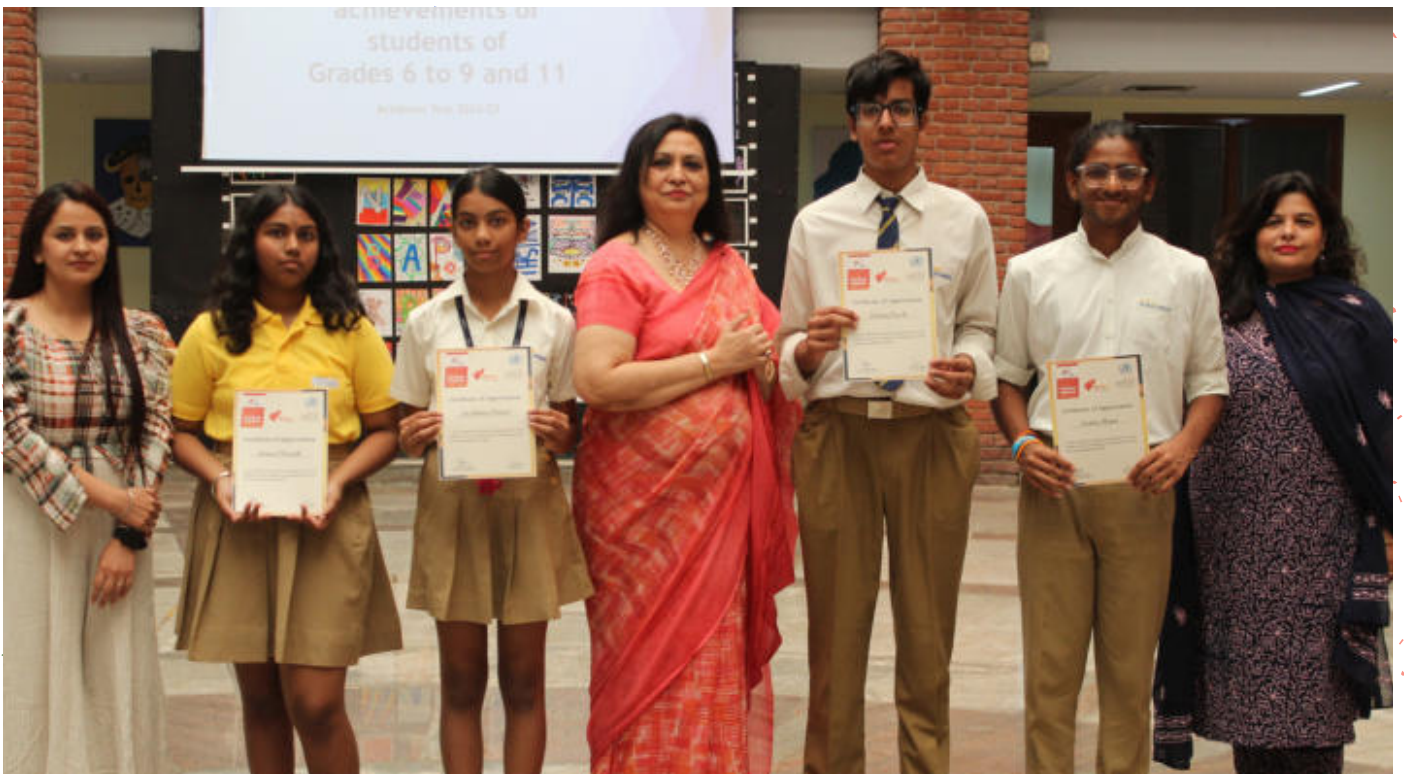
Students took part in the ILBS this year and received participation awards for the same.